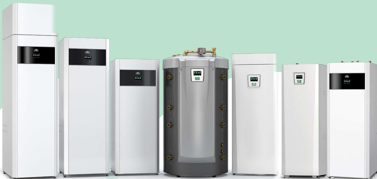
CTC EcoVent i360F

– refer to individual product sheets for more detailed information.